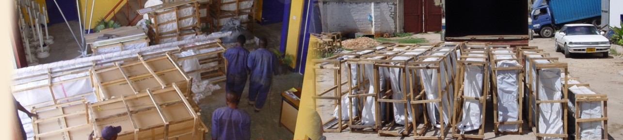
Our Signs and branding elements have been despatched and installed to numerous up-country nationwide and

components, a breakdown is a rare situation and should that ever happen, we pay full attention to address and correct the situation. Refer to the testimonials and you will see reputable companies offering their testimony on our quality, product, professionalism and