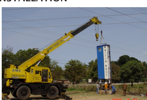
7m X 2m X0.6m Pylon Sign in the installation process on the concrete plinth also made by us.