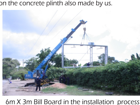
6m X 3m Bill Board in the installation process on the concrete plinth also made by us.